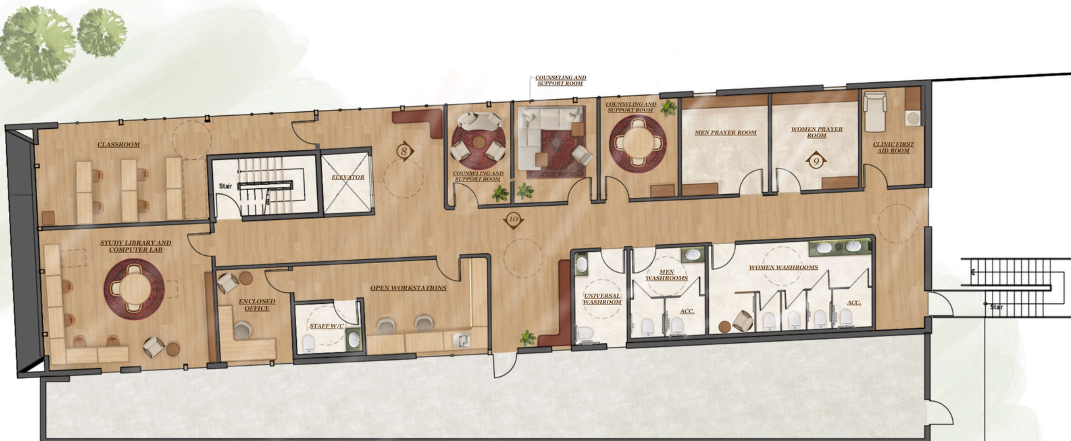
2 İPLIKTEN YUVA LEVEL 2 FLOOR PLAN