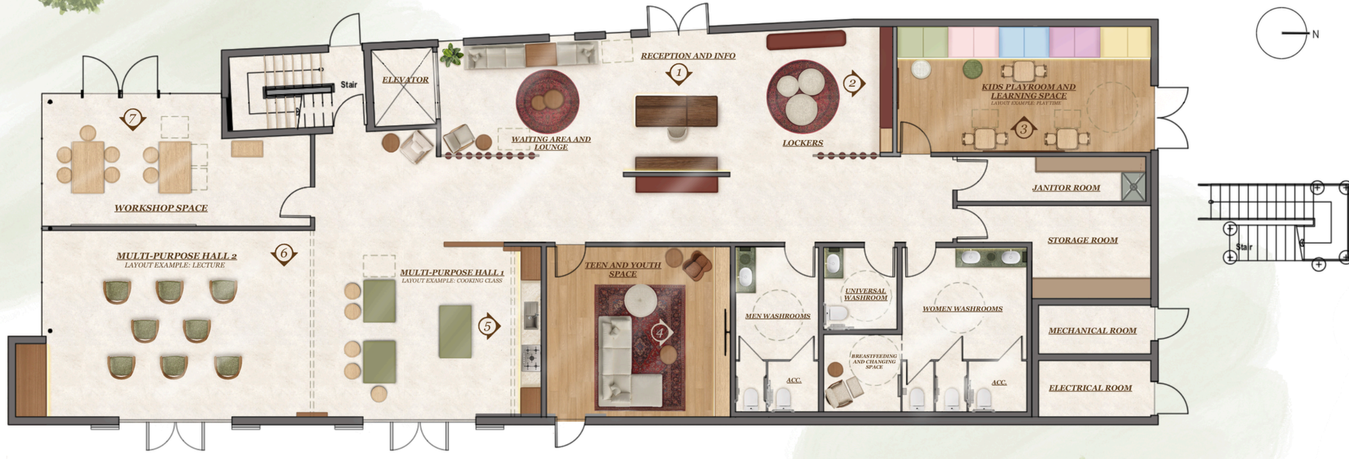
1 İPLIKTEN YUVA LEVEL 1 FLOOR PLAN

From this concept, the design intent is to create a space that avoids institutional harshness and instead offers warmth, dignity, and emotional safety. The project therefore prioritizes a home-like atmosphere through soft, layered materials and lighting, supports personal agency through privacy gradients and user control, and encourages healing and reintegration through spaces that balance quiet retreat with opportunities for connection. It also integrates culturally relevant design elements to create a stronger sense of familiarity, identity, and belonging within the space. In this way, İplikten Yuva is not just a support centre, but a home where diverse threads can be gently woven back into steadiness, belonging, and resilience.